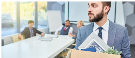
Outplacement Services for Corporations