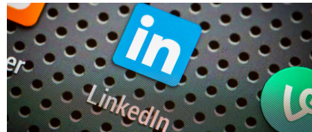
Career Documents & LinkedIn Profiles